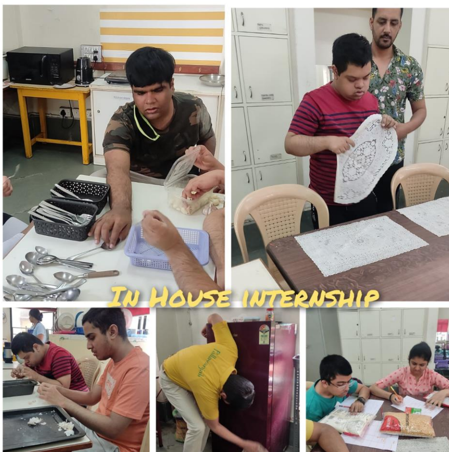
IN HOUSE INTERNSHIP

In Bakery lessons , we practiced the basic and most important preparation before entering the bakery - wearing an apron, cap, and mask and washing hands. This caters to Hygiene as part of learning in the work area.